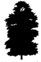
CEDAR ATLAS TREE=