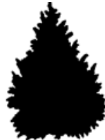
CYPRESS ARIZONA TREE