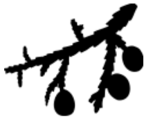
CEDAR RED LEAF