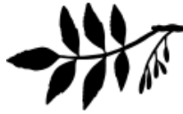
ASH TREE LEAF