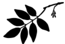
WHITE ASH LEAF