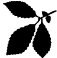
CHINKAPIN TREE LEAF