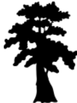
CYPRESS BALD TREE=