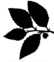
BEECH TREE LEAF=