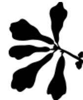
OAK WATER LEAF