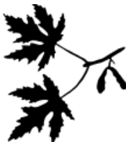
MAPLE SILVER LEAF