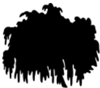
WILLOW WEEPING © Gary DeWitt