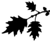
OAK RED LEAF=