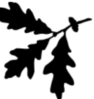
OAK WHITE LEAF