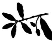
OAK LIVE LEAF