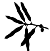
OAK WILLOW LEAF=