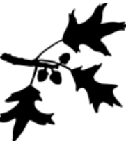
OAK PIN LEAF=