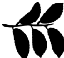
ELM TREE LEAF=