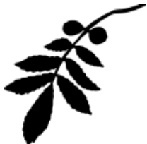
HICKORY TREE LEAF