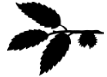
CHESTNUT TREE LEAF=