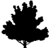
DOGWOOD WHITE TREE=