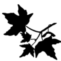
MAPLE SUGAR LEAF=