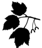
MAPLE TREE LEAF